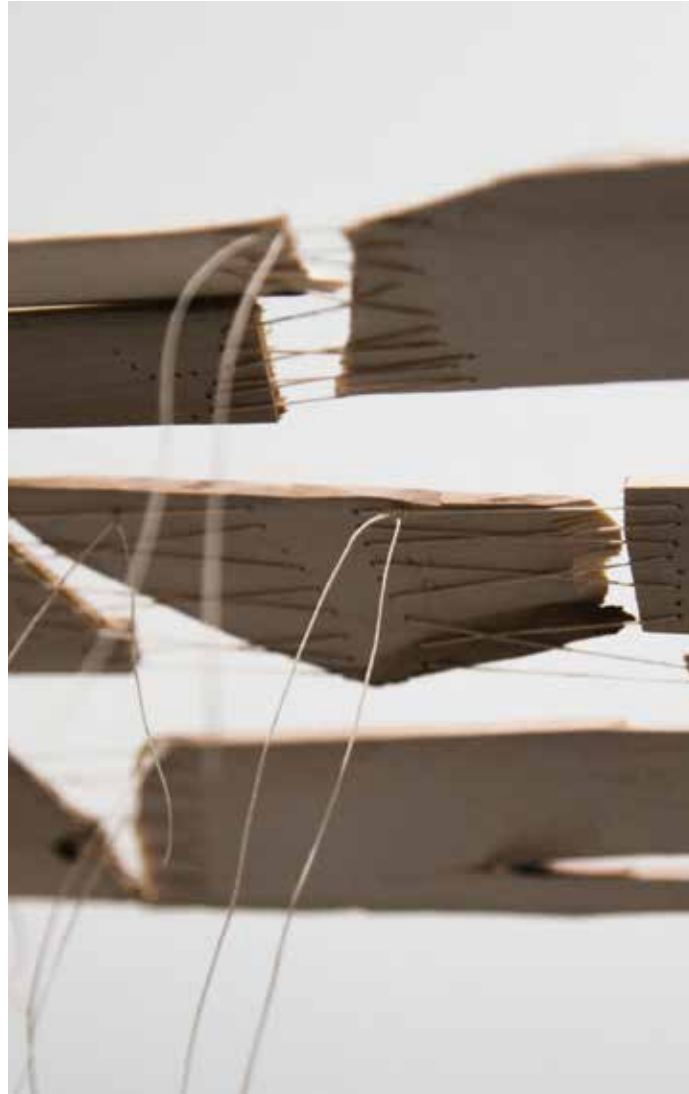
Intersticios / Interstítial